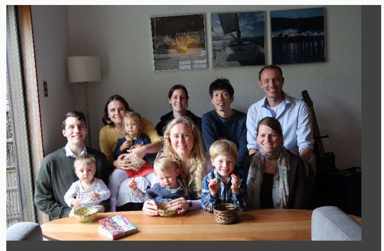
Easter Sunday with friends and colleagues